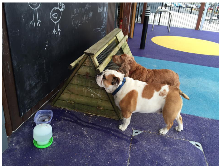
The Wellie Dogs meet the Wellie Chickens!!

Our curriculum plans are displayed outside each playroom for your information and feedback. If you would like to come in and help out or read a story, please let us know. The more the merrier!